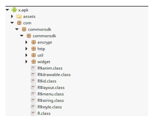
Figure 4. commonsdk package

The encrypt package contains encryption functions for the encrypted JavaScript files within the assets folder. The util package contains utility classes, for example AppUtil . AppUtil contains functions like isServiceRunning , openVideo and isAppInstalled . The functionality of those features should be pretty self-explanatory when reading the name.